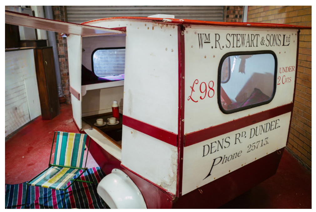
Nutshell compact folding caravan made in the 1950s by Stewarts Hacklemakers, Dundee.

the transport heritage of Dundee and the surrounding area. A new museum is under development in the city's Maryfield Tram Depot where the caravan will eventually be displayed.