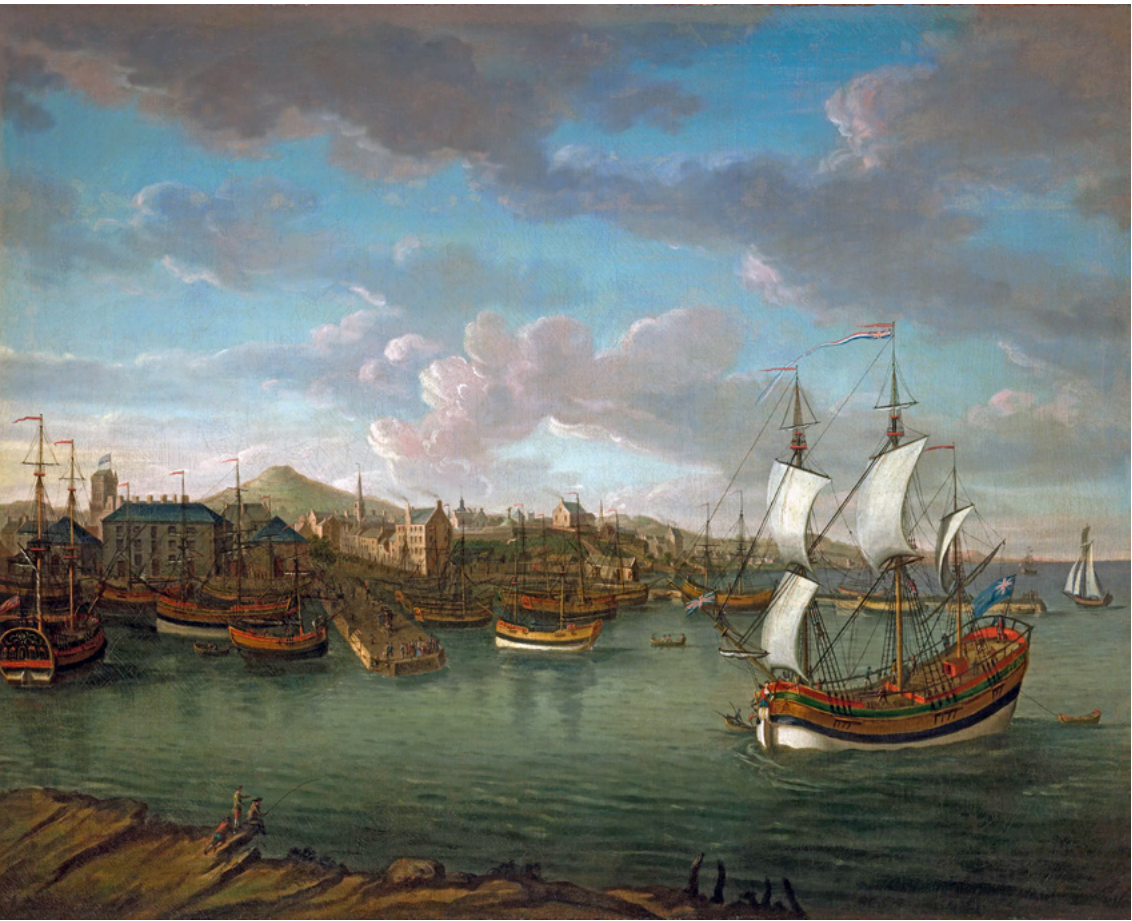
Oil painting on canvas, Dundee from the Harbour, c1776, artist unknown.

Glasgow Life received a grant of £15,000 to acquire an oil painting on hardboard, Cowcaddens Streetscape in the Fifties , 1964, by Alasdair Gray (1934–2019). One of the most significant Scottish artists of the postwar era, Gray was a prolific poet, playwright, novelist, painter and printmaker whose subject was Glasgow and its people. This large-scale painting, which Gray described as his 'best big oil painting', was included in his retrospective exhibition at Kelvingrove Art Gallery and Museum in 2014. While Glasgow Museums holds other works by Gray, this is the first major oil painting to enter the collection.