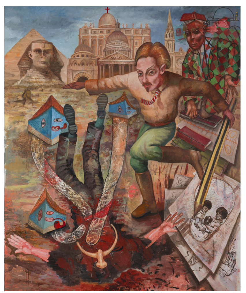
Oil painting on canvas, Portrait of the Lost Travelogue Writer , 2006-07, by Steven Campbell. City Art Centre, Museums & Galleries Edinburgh. © The Artist's Estate. Photograph: Antonia Reeve.

Museums and Galleries Edinburgh's fine art collection is a Recognised Collection of National Significance which traces the development of Scottish art from the 17th century to the present. The Fund contributed to the acquisition of works by five modern and contemporary artists. They included a grant of £8,000 to support the acquisition of an oil painting on canvas, Portrait of the Lost Travelogue Writer , 2006–07, by Steven Campbell (1953–2007), one of the