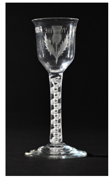
Eighteenth-century Jacobite wineglass.

Orkney Museums received a grant of \pm 3,659 to acquire a silver-plated tureen salvaged from the German High Seas Fleet which was scuttled at Scapa Flow following the end of the